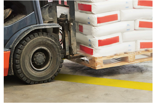
Won't peel off under forklift traffic.

Lays flat and is easy to position. Sticks on contact to most floor surfaces. Requires minimal tools or production downtime to apply — no dripping, drying, fumes or clean-up. When you're ready to change the area, tape typically removes cleanly in one piece without solvents.